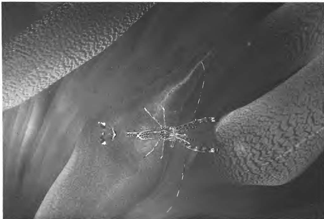
Figure 3. Periclimenes c.f. rathbunae photographed April 1982 on Condylactis gigantea . Bachelors Beach, Bonaire, Netherlands Antilles. Image size 1/2, depth 6 m.